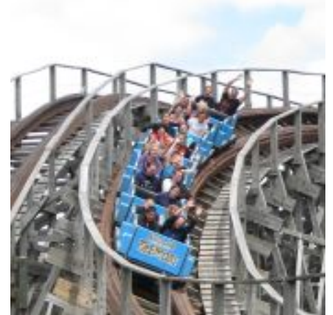
Students at Silverwood Theme Park.