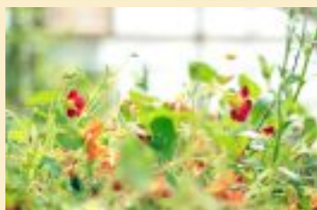
Monarch Greenhouse Flowers