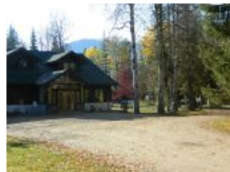
Above: The campus in fall Below: A view from campus of our beautiful mountain scenery