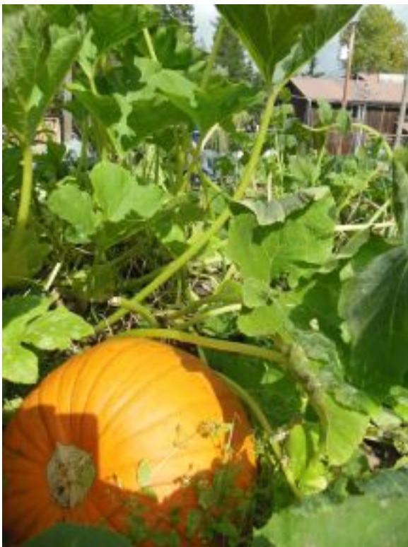
Monarch's Second Annual Harvest Meal; Enjoying the fruits of our labor